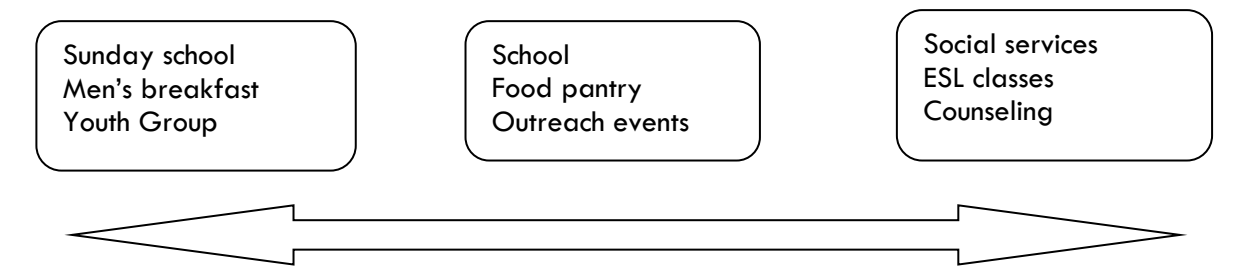
Exhibit 6-1-1 | Range of Place of Worship Ministries

A place of worship may have a range of ministries. Those on the left side of the continuum are typically thought of as traditional place of worship programs. Those on the right side of the continuum can start off on a small scale, but due to their nature a separate nonprofit may be formed. The ministries in the middle of the continuum may typically be retained within the legal structure of the place of worship. There are pros and cons to consider when a ministry is detached from the legal structure of the place of worship and a separate nonprofit is formed.