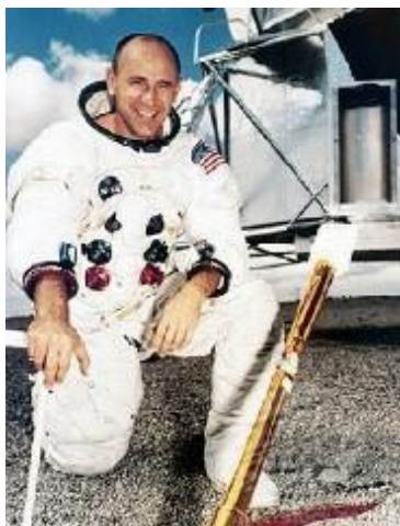
Astronaut Alan Bean, Omega Chi '55, the fourth human to walk on the Moon.

The 1970s brought changes to ΔKE. A decline in initiation fees and alumni dues, a legacy of the turbulent 60s, left the Fraternity in a serious financial bind, and the cumbersome operation of the ΔKE Council governing board of 44 chapter representatives, many of whom seldom showed up, led to delays in needed decisions.