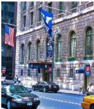
The Yale Club of New York City-- home of the ΔKE Club.

a gym, pool, library, meeting rooms, several restaurants and bars, including a roof garden, a lounge that would be a credit to the most elegant London club, and a wide range of services, from bootblack and barber shop to theatre tickets and limousines. Ten of the Club's 23 floors are given over to bedrooms, where members or guests can stay at less than the going rate for comparable hotels, and there is a wide range of Club sponsored events, from wine tastings to wild game dinners.