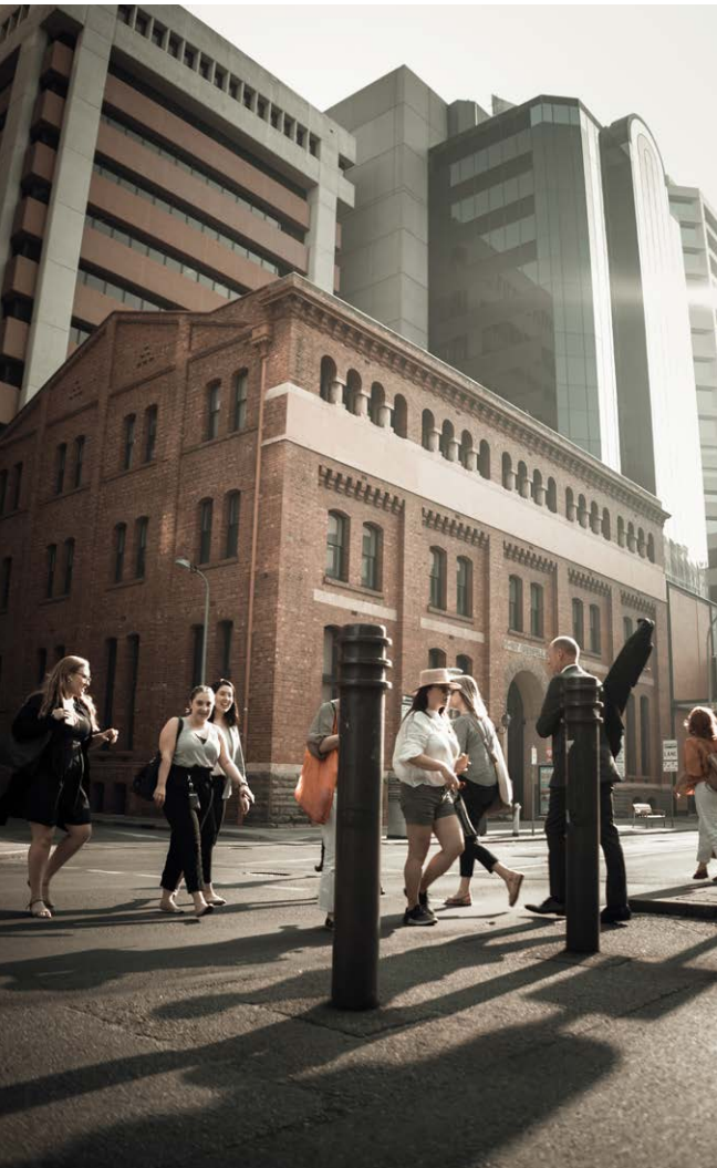
ADELAIDE

As part of their procurement processes many companies ask questions about the firm's commitment to corporate social responsibility, sustainability, diversity and inclusion and value-added services. These questions can be quite general in nature and may or may not mention pro bono legal services. These questions would usually be found in a Request for Tender (RFT) or Request for Proposal (RFP) document.