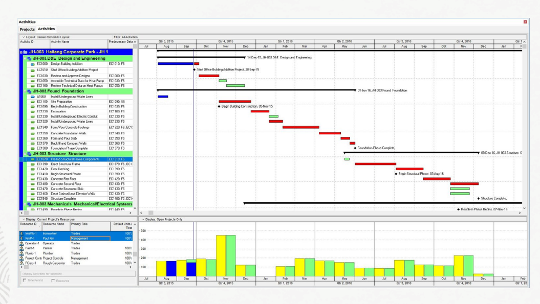
Figure 2. Optimize resources to keep projects on track and communicate resource requirements and decisions throughout project lifecycle.

Supporting both top-down and bottom-up resource request and staffing processes, Primavera P6 EPPM makes it easy for project and resource managers to communicate their requirements and decisions throughout a project's lifecycle. By providing a graphical analysis of resource and role utilization, Primavera P6 EPPM helps project teams manage resources in a dynamic environment. This allows managers to see where resources are being used across all programs and projects, as well as their forecasted future use. Because all information is in one centralized system, resource conflicts become apparent to project and resource managers, eliminating unexpected delays or unforeseen resource limitations. The result: greater visibility into resource demand and capacity means maximized resource use.